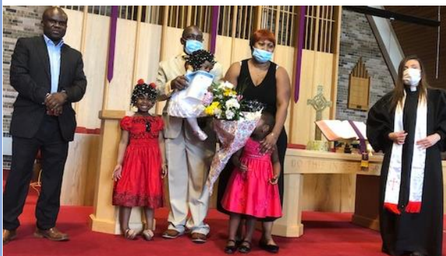
← Ijosarah's baptism.