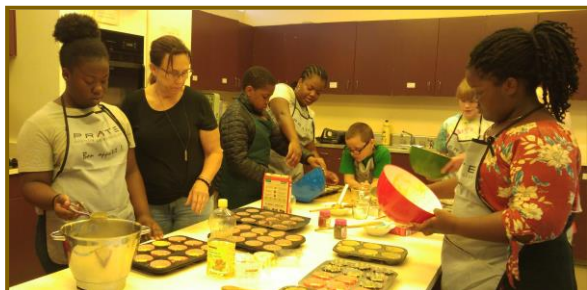
Fun Day making cupcakes