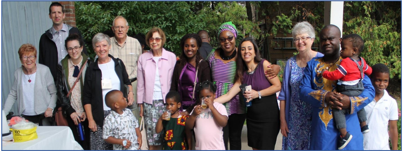
July, August and September Birthday Celebrations